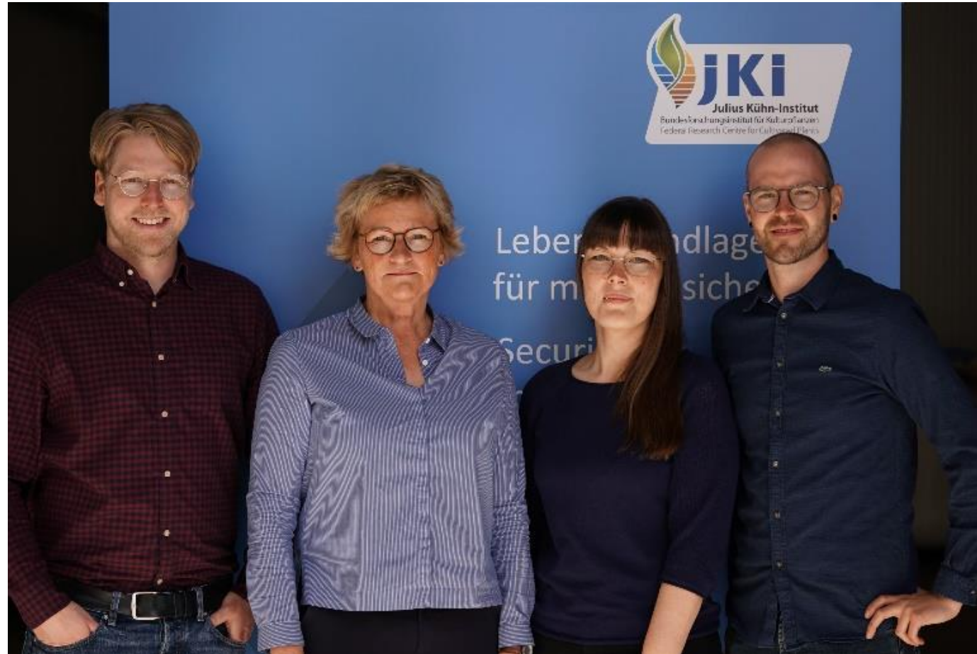
Das Team in Groß Lüsewitz